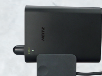
Stand and AC Adaptor for NSI-X

* With a rechargeable battery pack and DC plug, illumination can be achieved for extended periods of time. When using the battery pack, high-speed charging capabilities achieve a full charge in 2.5 h and allow up to 3.5 h of continuous lighting at maximum intensity.